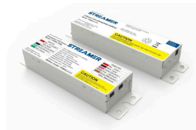
LED Emergency LED Driver SKU: AA-EmergencyLEDDriver-Strip