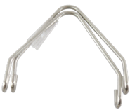
V-Hooks SKU: HangingKits