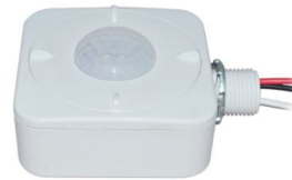
PIR Bluetooth Sensor SKU: AA-SENPIRBT-BRI819PBDBLE