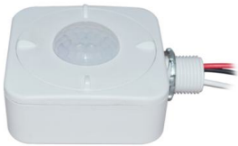
PIR Occupancy Sensor SKU: AA-SENPIRAC120347VOF