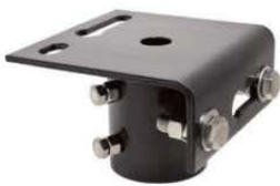
Slip Fitter SKU: AA-700046