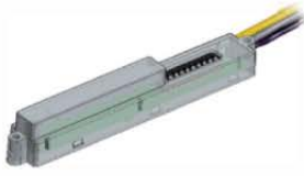
Microwave Dimming Sensor SKU: AA-SENMW-ANT3A