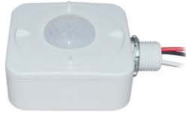
PIR Bluetooth Sensor SKU: AA-SENPiRBT-BRI819PBDBLE