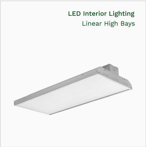
LED Interior Lighting Linear High Bays