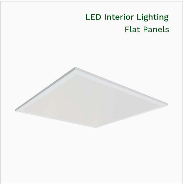
LED Interior Lighting Flat Panels