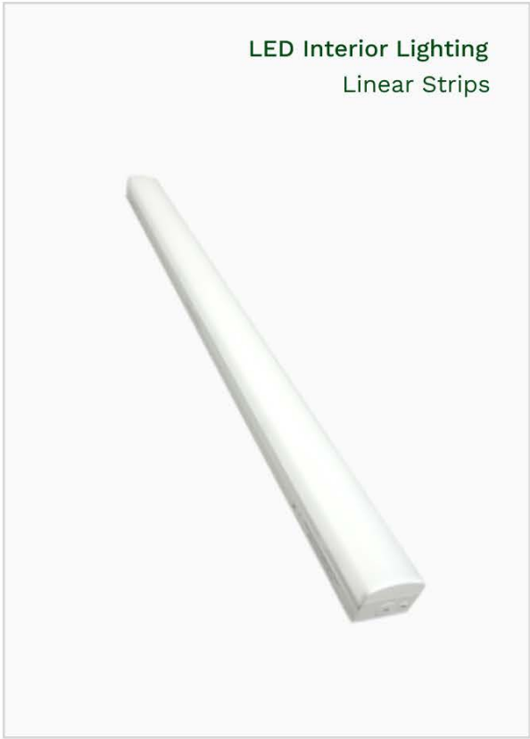
LED Interior Lighting Linear Strips