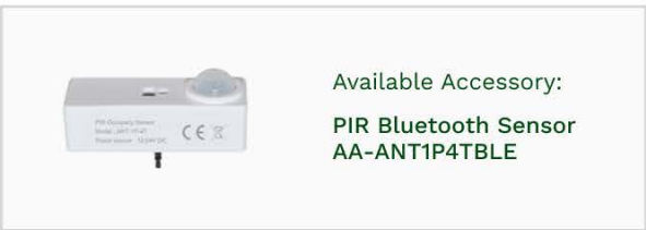
Available Accessory: PIR Bluetooth Sensor AA-ANT1P4TBLE