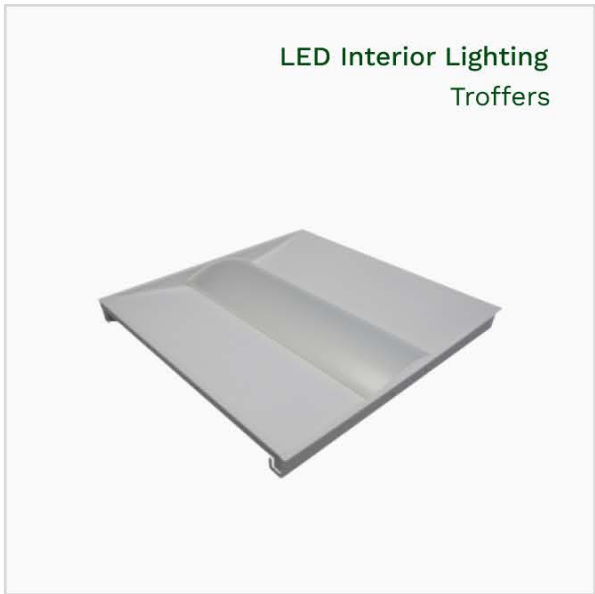
LED Interior Lighting Troffers