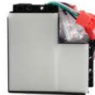
“L” Connector For 2.8” Housing SKU: ASTP-L Connector