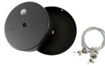
Suspension Kit, Black Finish SKU: AA-ASTP-SuspensionKit