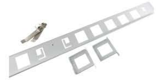
Recessed Mounting Kit For 4FT SKU: AA-ASTP-RecessedMounting-4F