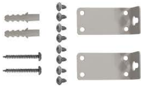
Wall Mounting Kit For 2.8" Housing SKU: AA-ASTP-WallMountingKit