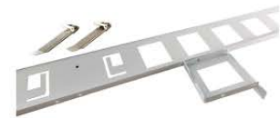
Recessed Mounting Kit For 8FT SKU: AA-ASTP-RecessedMounting-8F