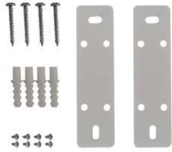
Surface Mounting Kit For 2.8" Housing SKU: AA-ASTP-SMK