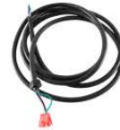
10FT 600V Leads W/Quick Connector, Black SKU: ASTP-10F600VB